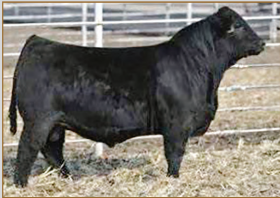
TJ ARROWHEAD 263G - SAI SIRE TO BRED HEIFERS' K1579, K1724 & K1813 PREGNANCIES