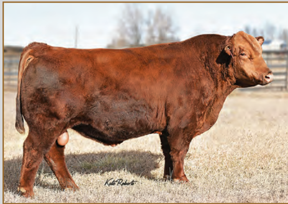
WS ALL ABOARD B90 GRANDSIRE OF L1863