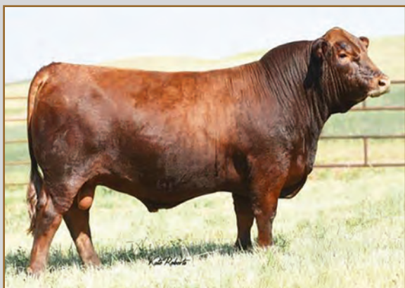
CDI PERCEPTION 254E SIRE OF L1954