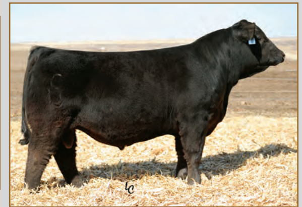
CCR COWBOY CUT 5048Z GRANDSIRE OF L2061 AND L2065