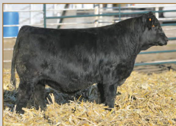
TJ GOLD 274G - SIRE TO 16 LOTS