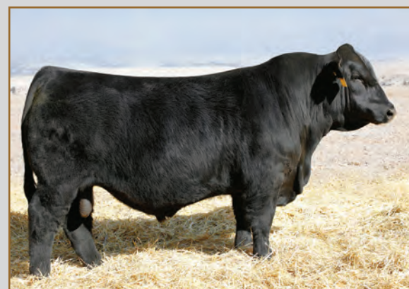
KBHR HONOR Ho60 - SIRE TO 6 LOTS