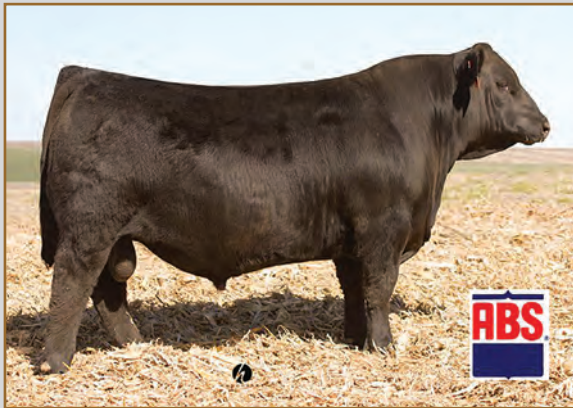
CCR ABILENE 6018C GRANDSIRE OF L2045