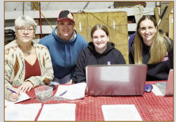
SALE CLERKING CREW