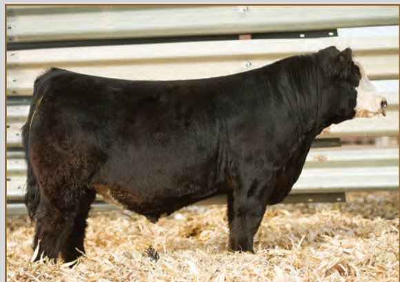
FELT GETCHA SUM G113 SIRE OF L1440 AND L144