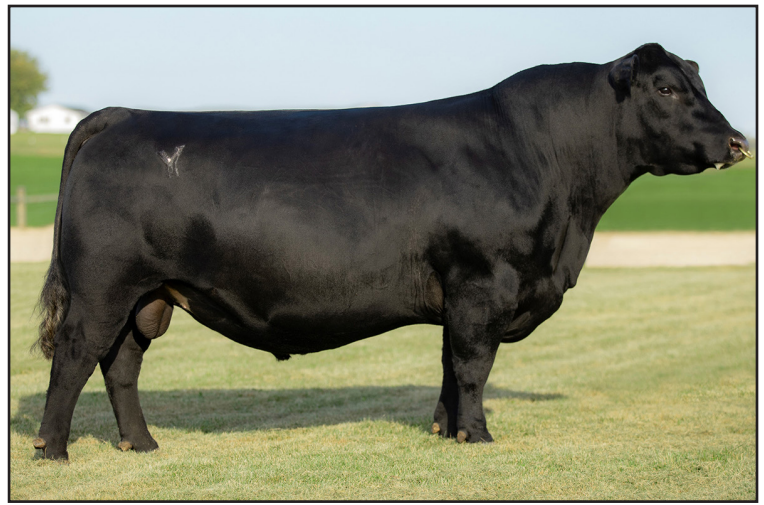
Yon Top Cut Service Sire on Lots 10, 12 and 16