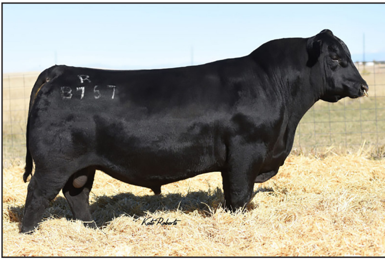
Tehama Tahoe B767 Daughters sell in Lots 2 and 19