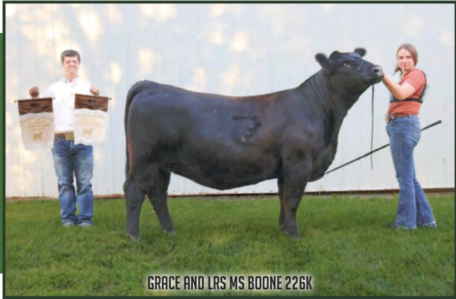
GRACE AND LRS MS BOONE 226K

Another really young calf who ratioed 107 off the cow. These April calves will not even be 10 months old on sale day.