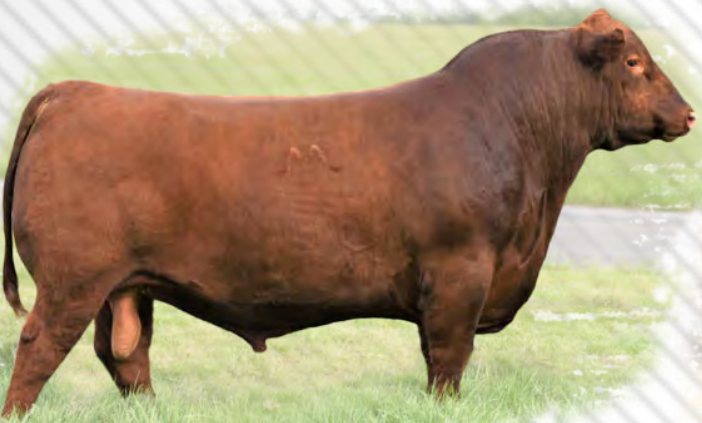
4MC THE COWBOY WAY 970 - SIRE OF LOTS 11 - 14 REG #: 4184814