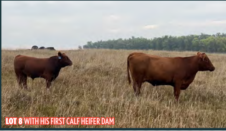
LOT 8 WITH HIS FIRST CALF HEIFER DAM