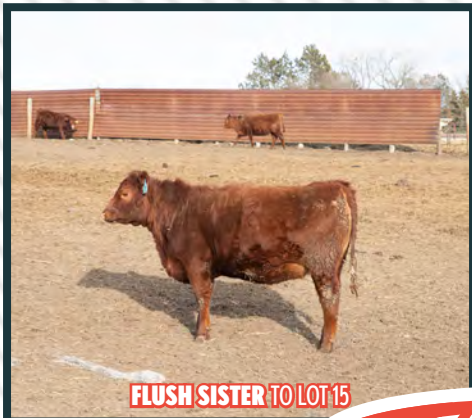
FLUSH SISTER TO LOT 15