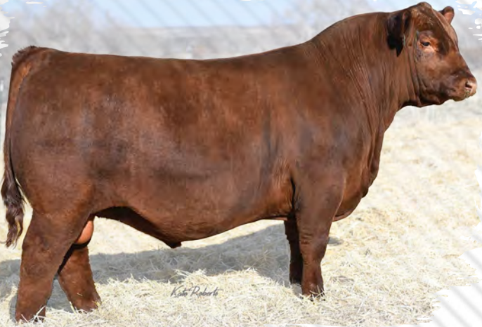
TOWNSHIP 17G - SIRE OF LOT 6 REG #: 4265551