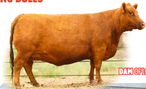
DAM OF LOT 7