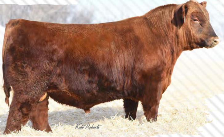
STRA RELENTLESS - SIRE OF LOT 8 REG #: 3955293