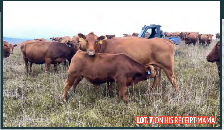
LOT 7 ON HIS RECEIPT MAMA