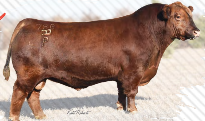
PELTON WIDELOAD 78B - SIRE OF LOT 1 REG #: 1704763