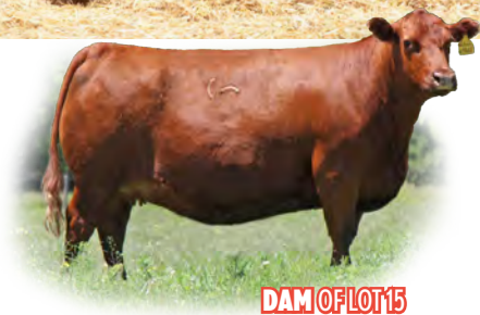
DAM OF LOT 15