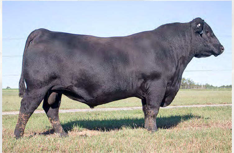
Sire to Lot 19 Yon High Cotton D885