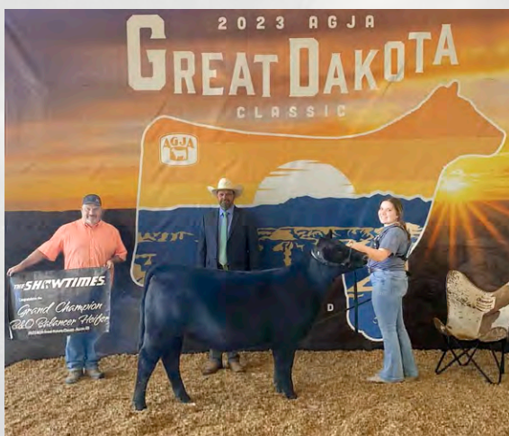
AGJA Champion Bred & Owned 2023

Buyer has option to select a different sire if they choose.