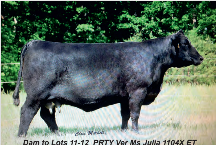
Dam to Lots 11-12 PRTY Ver Ms Julia 1104X ET