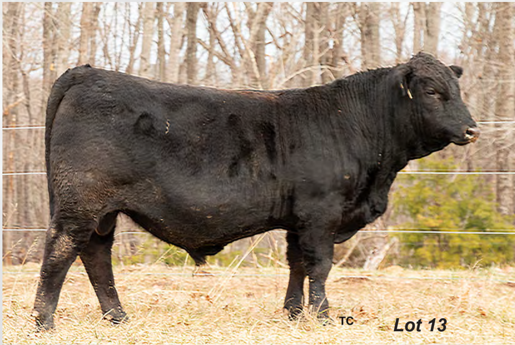
TC Lot 13