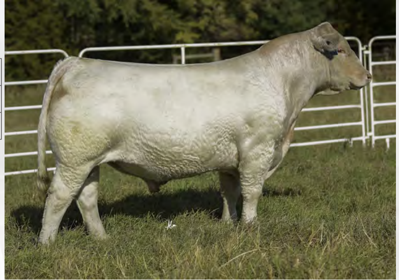
Sire to Lot 42 WDC Kingsman 737P

Here is a very nice, very easy fleshing female with an outstanding pedigree. This heifer was dehorned. She is ready to breed immediately.