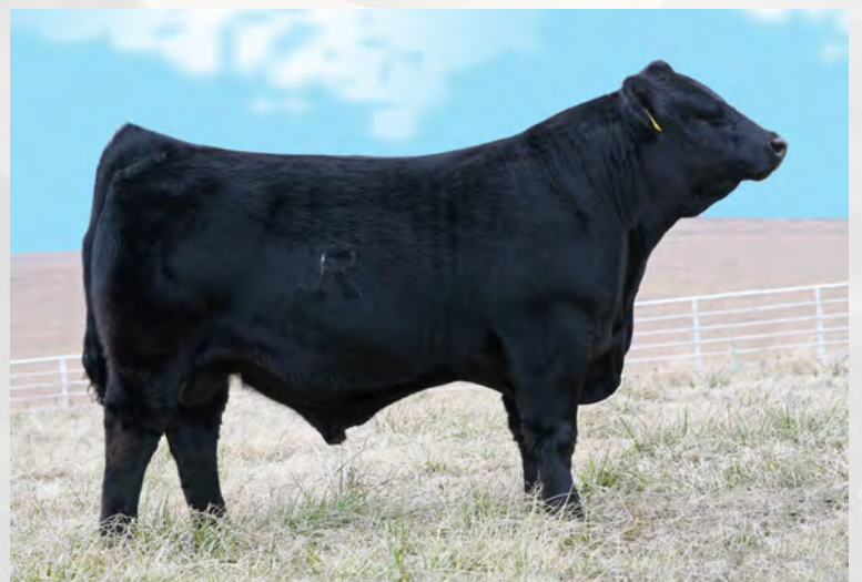
Sire to Lots 1 & 2 - JRI Alan 68G3