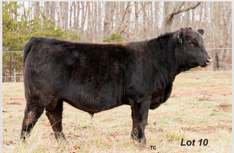
TC Lot 10