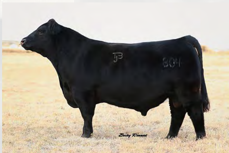
Rebel Yell 804F ET

Guarantee of 6 Embryos and 3 Pregnancies