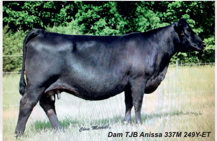
Dam TJB Anissa 337M 249Y-ET

TJB 249Y is a can't miss donor female. She works to every bull we have flushed her to. This mating to Baller will produce high percentage gelbvieh and we have retained several of these females in the herd this year.