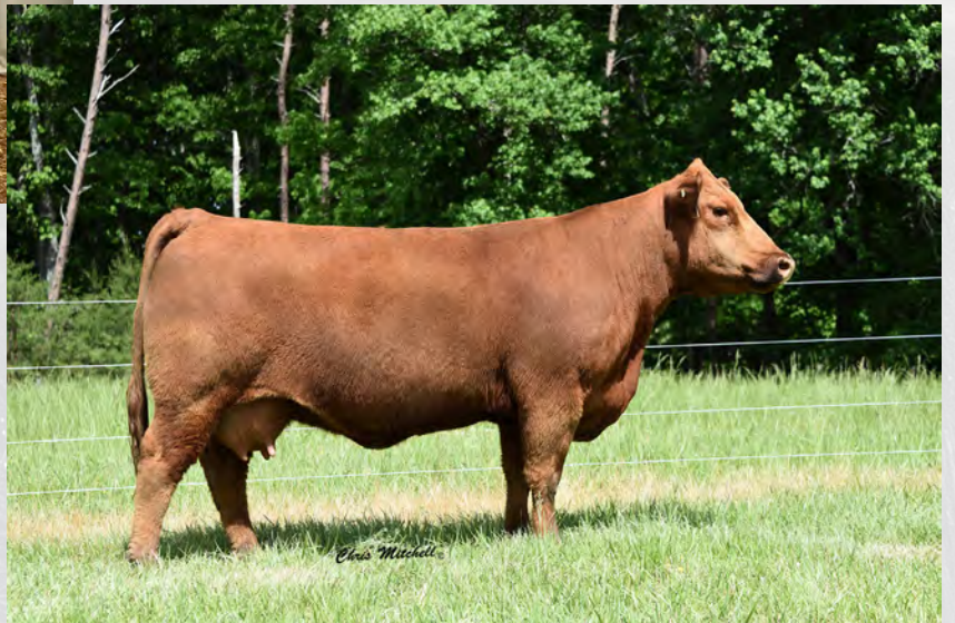
Grand Dam to Lots 15-17 GCGF Niki 701E