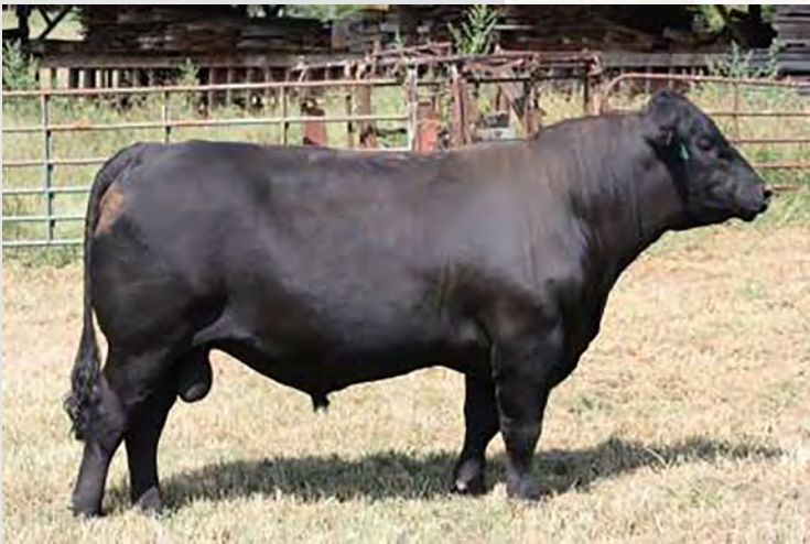
Sire to Lot 18 URF Alpha G138