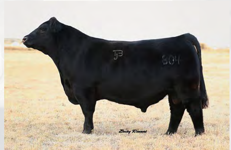
Sire to Lot 17 - TJB Rebel Yell 804F ET