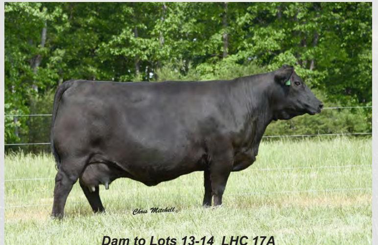
Dam to Lots 13-14 LHC 17A