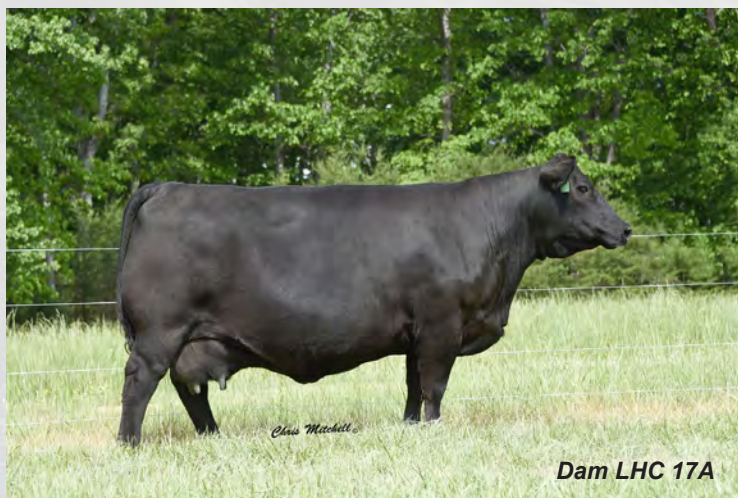
Dam LHC 17A

LHC 17A has the most mass, power, and rib shape of any cow on the farm. She was the high seller in our first production sale selling to Greeh Hills Gelbvieh for $7500 for half embryo interest.