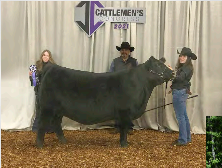
Dam to Lots 15-17 GCRK Vicki 903G