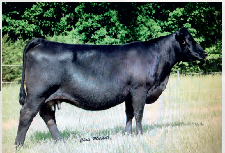
Dam to Lots 1, 2 & 3 - TJB Anissa 337M 249Y - ET