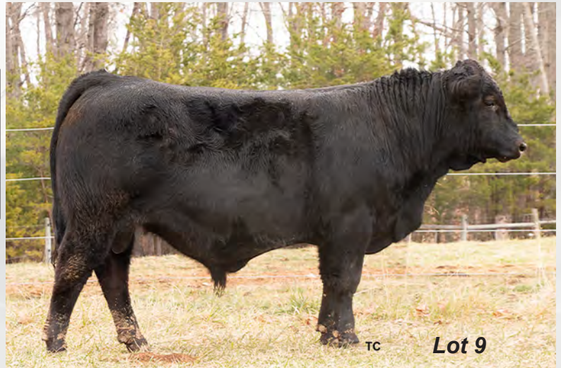
TC Lot 9