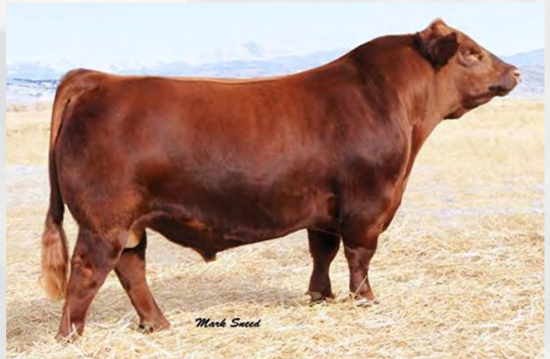
Maternal Grand Sire to Lot 41 Red Northline Rock Star 911U