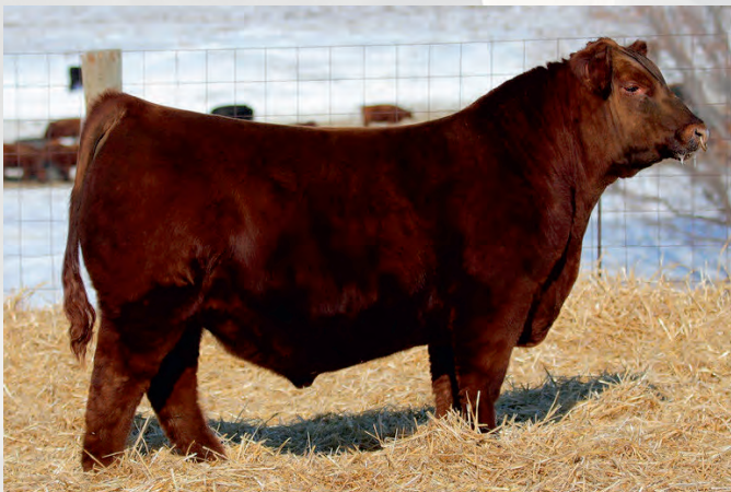
Paternal Grand Sire to Lots 22 & 23 - Six Mile John Wick 882E

These bulls are sired by Six Mile Joaquin 458J. Joaquin is a John Wick son that I purchased a few years ago from the famed Six Mile Ranch in Canada. These 3 bulls are a little on the young side, but if you can wait a few months, the genetics are definitely in the package. Look through these bulls and pick the one that suits your needs. The 2314 bull is halter broke and was shown at NC State Fair