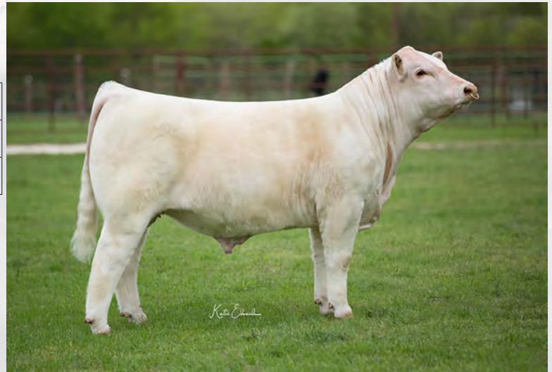
Sire to Lots 43 & 44 DCC Who's Hoo 1709 PLD

This heifer is very quiet and friendly. She carries a bit more frame. Her dam has one of the prettiest udders of any cow that I have ever seen. 2251 is ready to take home and breed