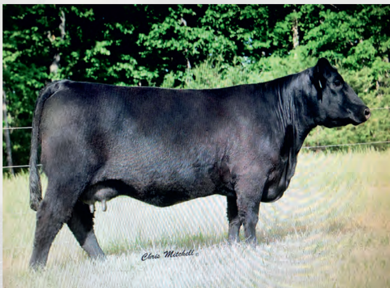
Dam to Lot 25 - HMEG 413B