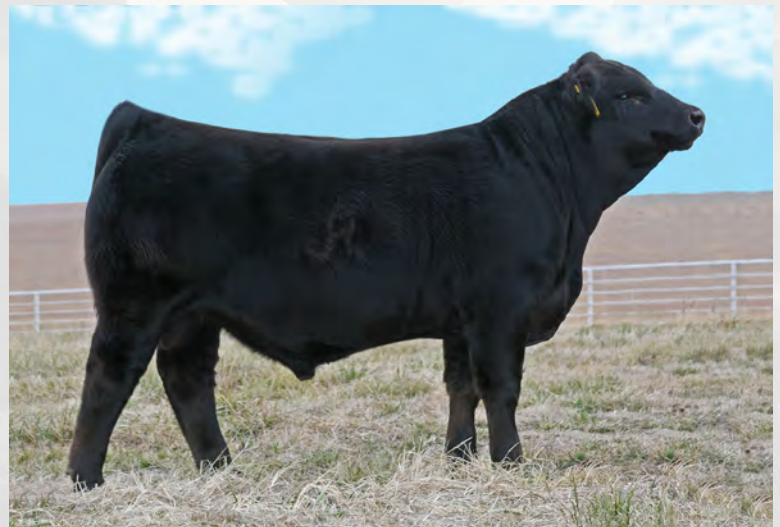
Sire to Lot 4 JRI Bottom Line 254G9