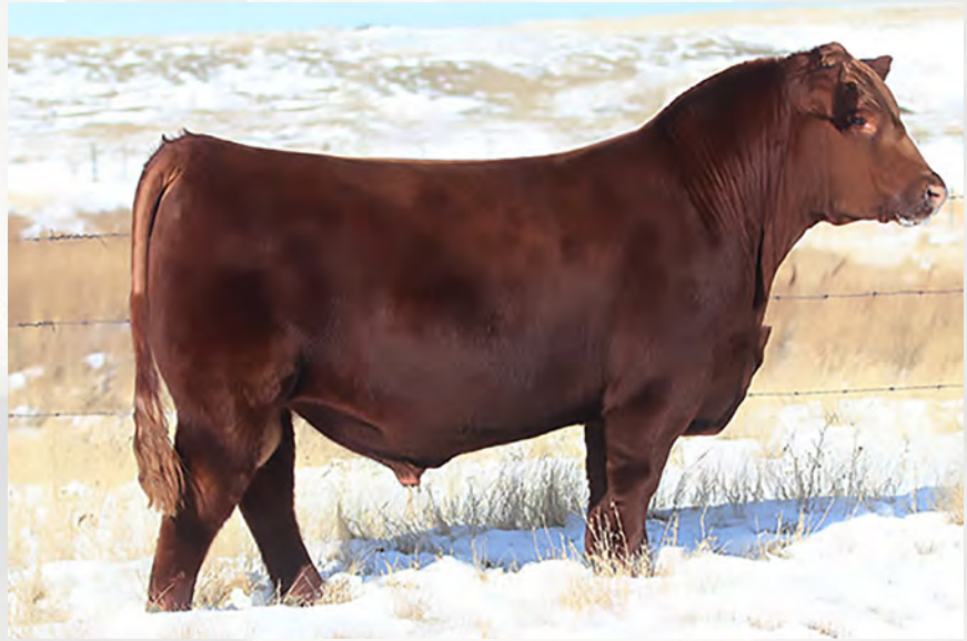
Sire to Lots 20 & 21 - Six Mile Parabellum

These outstanding Parabellum sons are full of meat and rib. They also have a ton of bone to go along with tremendous hip. 2260 goes back to our wonderful donor cow, WDWZ Girl Power, who was a many time champion. Look these bulls up sale day