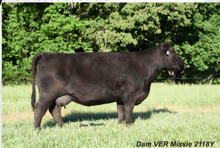
Dam VER Missie 2118Y

5 Embryos available - Embryos will be BA75