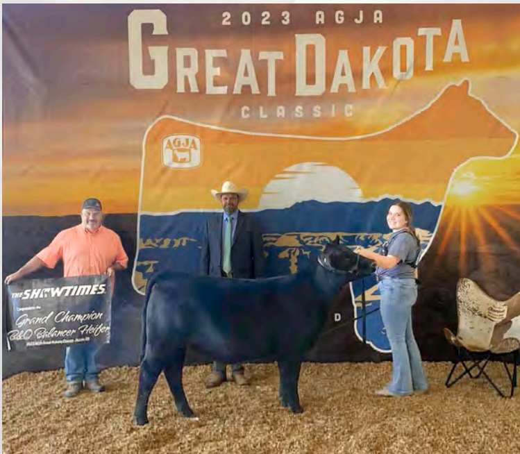
AGJA Champion Bred & Owned 2023 Full Sib to Lot 17