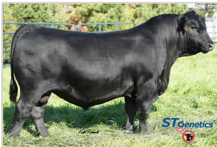
Reference Sire • Hoffman Thedford

Excellent maternal pedigree with performance.