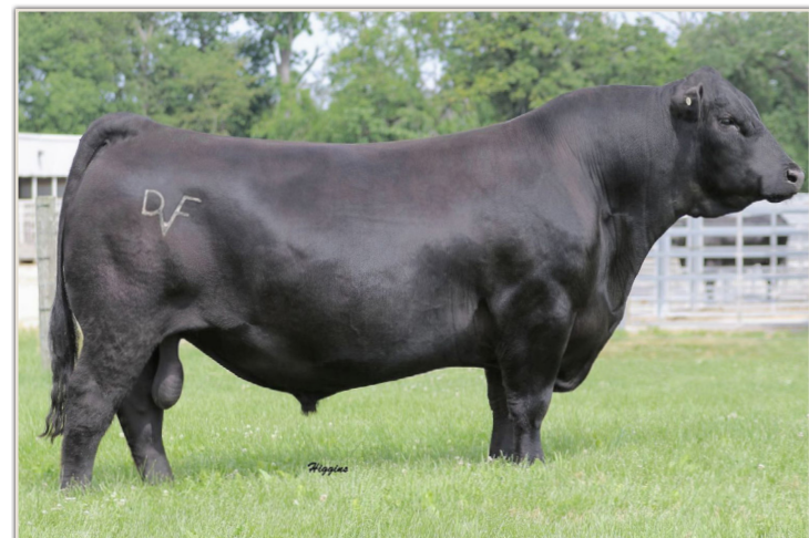
Reference Sire • Deer Valley Growth Fund

14,357 BW's recorded 11,492 WW's recorded 3,422 scans 1,054 foot scores 11,761 DNA scores