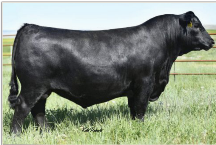
Reference Sire • LAR Man in Black

Dam has 4WW@110 and 3 YW@103. Two generations of Pathfinder dams.