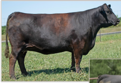
Donor Dam of Lot 78 Smith Valley Blackbird 9002