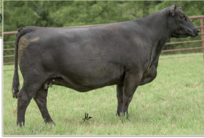
Donor Dam of Lot 79-80 Pine View Rita E004