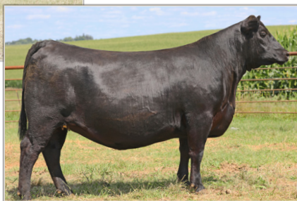
Donor Dam of Lot 13 HF Barbara 0169