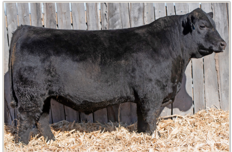
Maternal Brother to Lot 36 • HF Growth Fund 0163 sold to Crooked Creek Angus in 2022

Donor dam has 4 BW@97, 4 WW@104, and 3 YW@102.