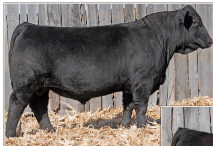
Maternal Brother to Lot 91 Henke Signal 1011 sold to Poor Folk farms in 2022

High performance and fertility improver.