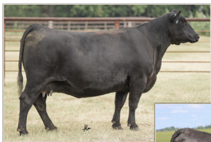
Donor Dam of Lot 12 GVC Susanna D313

Dam has 7 WW@101 and 6 YW@106. She reports 7 calves in a 365-day calving interval. Top 15% Claw EPD.