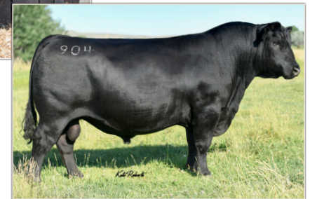
Reference Sire Sterling Pacific 904

Maternal Brother to Lot 47 Henke Regiment 1233 3rd top seller to Poor Folk Farms in 2023