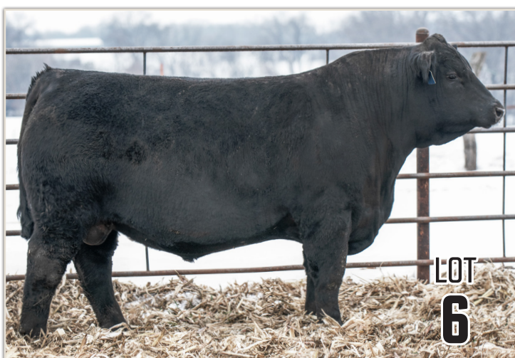
Dam is a flush sister to Barbara 0169, our leading donor in partners with De-Su.