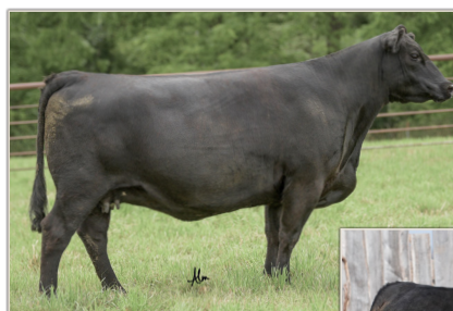
Donor Dam of Lot 8 Pine View Rita E004

Dam reports 2 calves in a 342-day calving interval. She is a daughter of the most prolific producer in our herd.