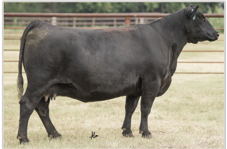
Dam of Lots 1, 2, 3, 12 • GVC Susanna D313

Donor Dam has 4 WW@103 #1 DOC EPD BULL IN THE SALE!