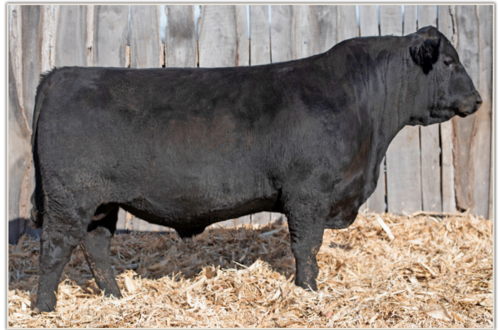
Maternal Brother to Lot 53 • HF Jet Black 0173 sold to Jerry Taylor in 2022