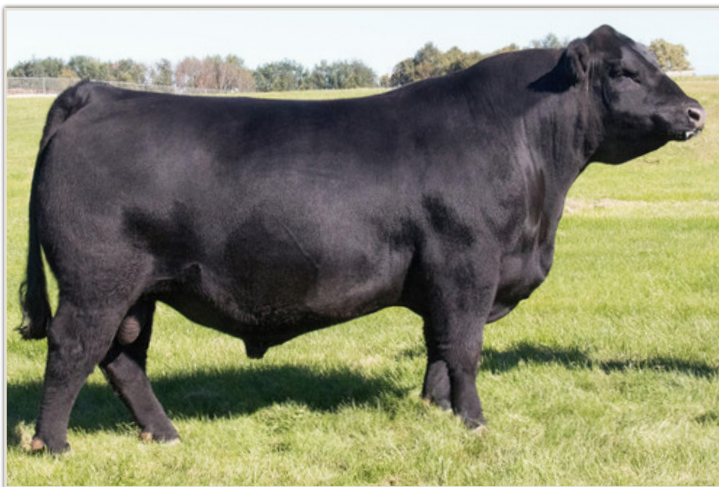
Reference Sire • B A R Dynamic

A Whole Lot of EPDs The American Angus Association reports 31 different EPDS and Index's on each animal. While we look at and utilize many of these to make more precise decisions we also understand that most of them are just too much for a bull sale catalog. You may see in some footnotes a reference to an EPD that's not listed. If you are interested in any more data that is note reported here feel free to visit www.Angus.org and type in the bull's registration number in the upper right hand corner of the web page.