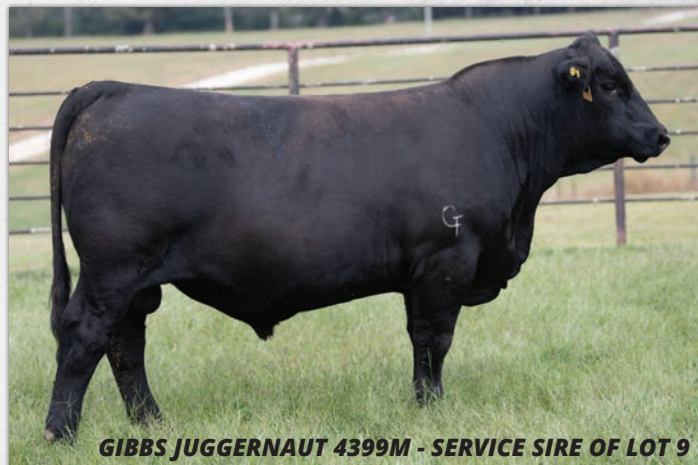
GIBBS JUGGERNAUT 4399M - SERVICE SIRE OF LOT 9

AI'd to GIBBS JUGGERNAUT 4399M (ASA# 4438508) on 11/19/25. PE to GIBBS HIGHWAYMAN 3130L (ASA# 4284752) from 12/1/25 to 2/8/26. Confirmed bred, too close to determine AI or PE service. M50 is a big soggy star faced female that will be sure to raise some good calves. Her dam always brings back a heavy calf at weaning. Possible chance of getting one of the first Juggernaut calves if she calves to AI. Pasture exposed to Highwayman so either way her calf should be a special one.