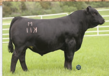
ES MAXX MK11 SIRE OF LOT 57B EMBRYOS