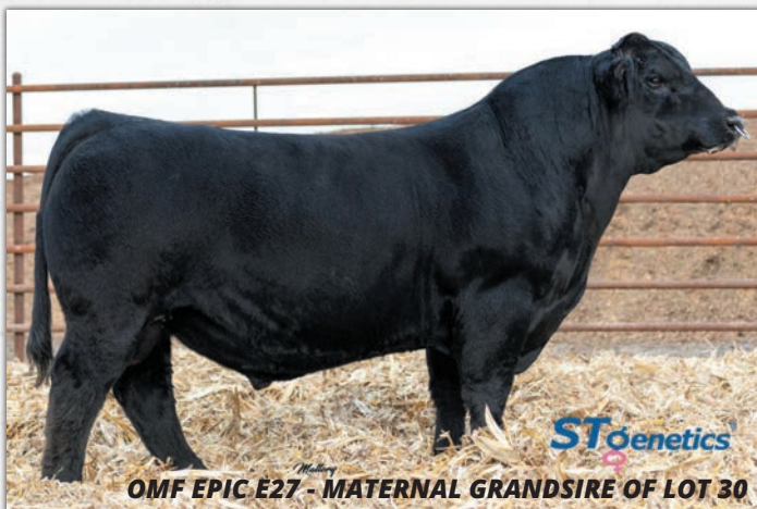
OMF EPIC E27 - MATERNAL GRANDSIRE OF LOT 30

Stylish and ultra feminine made Hard Knox daughter. N223 is a baldy and ready to breed to the bull of your choice. Sells with GE epds.