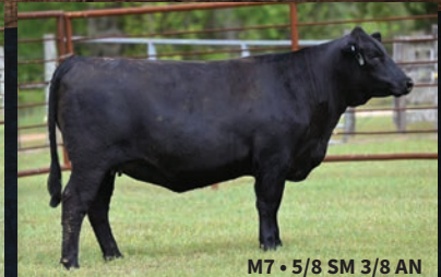
M7 • 5/8 SM 3/8 AN

ASA# 4532423 • Homo Black • Homo Polled RVR ROGUE 530H x BLPF MISS EMPRESS C2