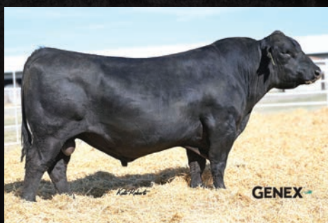
GIBBS 9114G ESSENTIAL