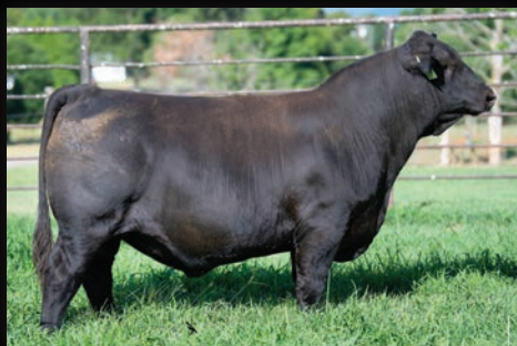
GIBBS HIGHWAYMAN 3130L