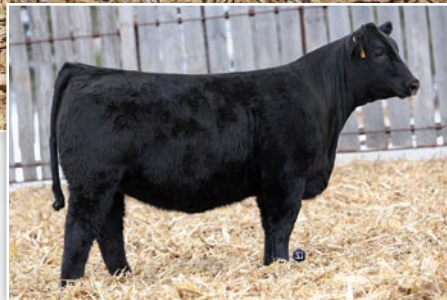
RFS Miss N6 - High Selling, $110,000 Full Sister

NORTHERN EXPOSURE SEMEN WILL NOT SELL AGAIN UNTIL NEXT FALL IN SPECIAL SALES TO BE ANNOUNCED.