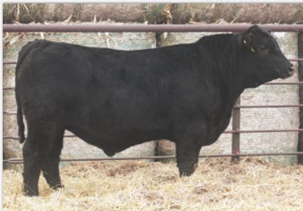
KRRS TRIFECTA 475M SIRE OF LOT 56 EMBRYOS