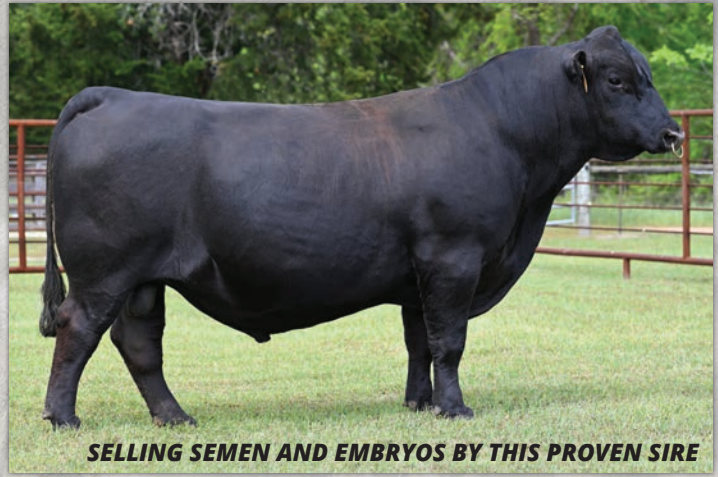
SELLING SEMEN AND EMBRYOS BY THIS PROVEN SIRE