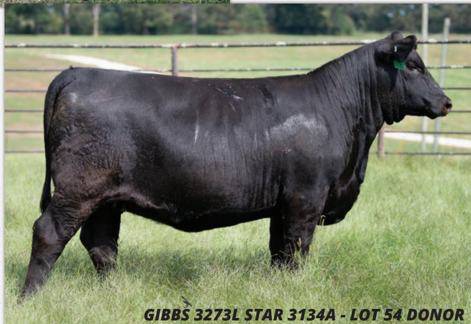
GIBBS 3273L STAR 3134A - LOT 54 DONOR