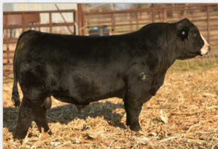
GIBBS BLAZER 3L02 SIRE OF LOT 54 EMBRYOS