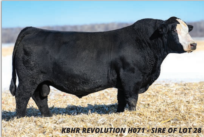
KBHR REVOLUTION H071 - SIRE OF LOT 28

You won't find many red purebred Simmentals raised in the southeast, so here is your chance. Very balanced genetic profile with a jam up pedigree. Sired by CDI Honor Guard and with a 14 year-old dam still in production. A rock solid pedigree and proven genetics to boot. Top 15% API. Tom Hook has always bragged about how good his daughters of Hook's Xpection 36X are. They are increasingly hard to come by.