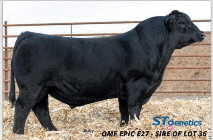
OMF EPIC E27 - SIRE OF LOT 36

PE to FFS JNR Hard Knox H034 (ASA# 3794725) from 1/5/26 to 3/18/26. Epic daughter with a bright future ahead of her, heifer calf at side.