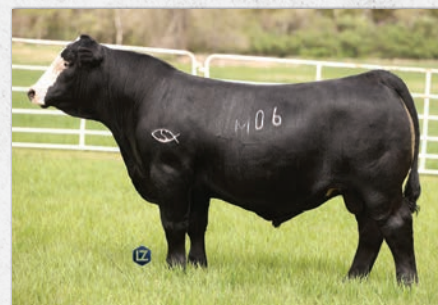
SCHOOLEY/EOR MAINSTAY M06 SIRE OF LOT 53 EMBRYOS