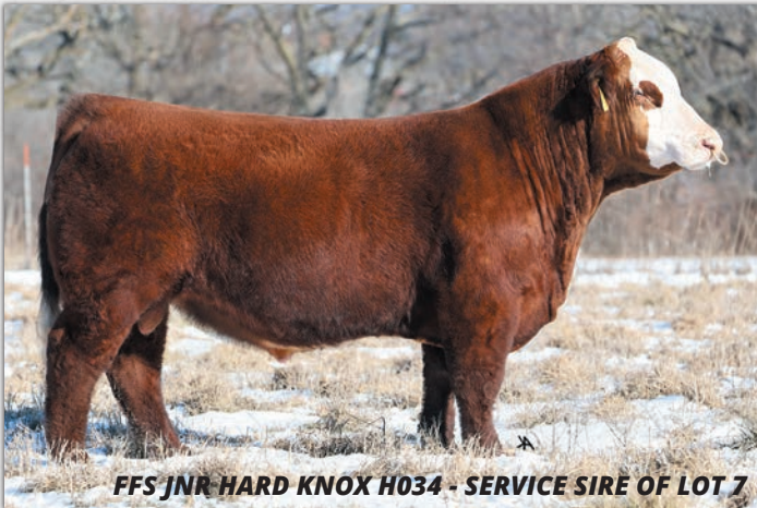
FFS JNR HARD KNOX H034 - SERVICE SIRE OF LOT 7

AI'd to CCR BEDROCK 5171J (ASA# 4028738) on 11/29/25. PE to TJ CHOSEN ONE 503M (ASA# 4366332) from 12/14/25 to 2/22/26. Confirmed bred to PE dates. A direct daughter of our Gibbs Guardian herd sire, this heifer is expected to blend maternal ability with a punch of power. Vet confirmed safe to TJ Chosen 503M.