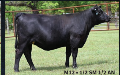
M12 • 1/2 SM 1/2 AN

ASA# 4532435 • Homo Black • Homo Polled KBHR REVOLUTION H071 x BLPF MISS DORIS B15