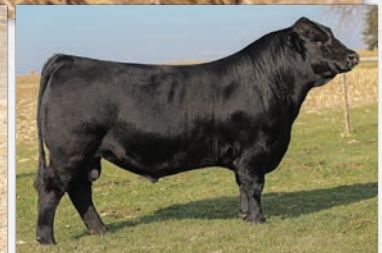
ADV COMPASS L3574 SIRE OF LOT 57D EMBRYOS