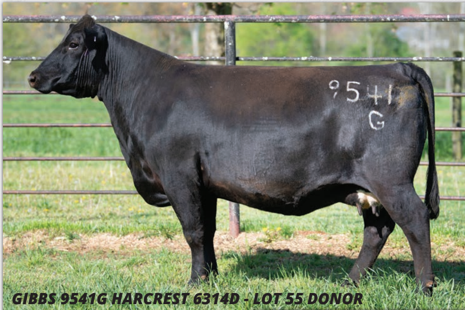
GIBBS 9541G HARCREST 6314D - LOT 55 DONOR