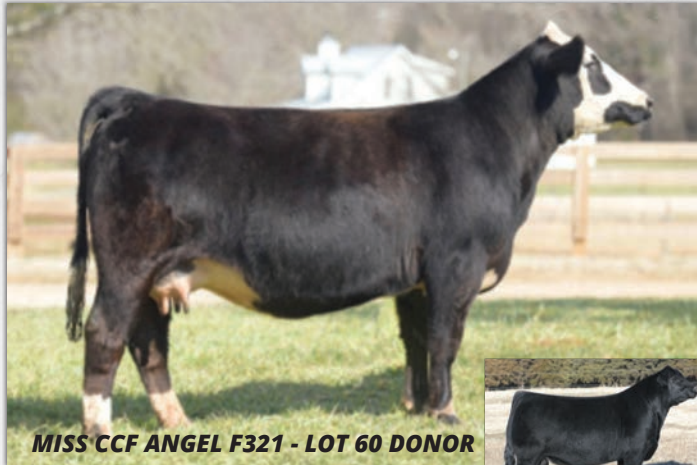
MISS CCF ANGEL F321 - LOT 60 DONOR