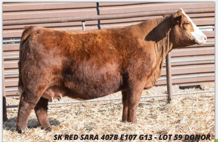
SK RED SARA 407B E107 G13 - LOT 59 DONOR

Selling 3 IVF, Sexed Female Semen embryos. Guaranteeing 1 pregnancy if implanted by a certified embryologist. Stored at Preferred Genetics, Columbus NE. This female may very well be the best cow in our entire operation. Anyone who has followed our program knows the impact of the Red Sara cow family. We firmly believe she stands among the elite red cows in the Simmental breed today. She is mated to the ultra stylish Against the Odds, a Cross were extremely excited about. This pairing is designed to produce high end red baldy heifers with the look balance and presence to compete at the highest level. Get in on the opportunity and make some truly standout red baldies.