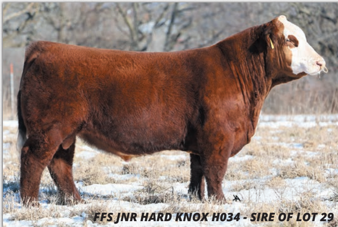
FFS JNR HARD KNOX H034 - SIRE OF LOT 29