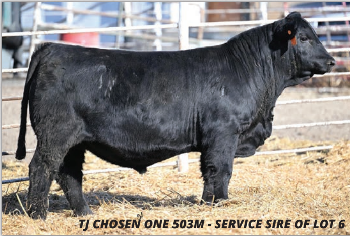
TJ CHOSEN ONE 503M - SERVICE SIRE OF LOT 6