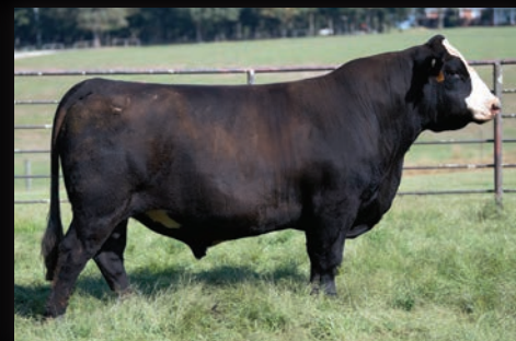
LCDR RESERVE 210J