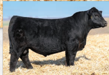
KBHR MONACO M021 SIRE OF LOT 58A EMBRYOS