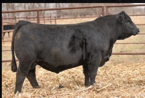
CCR BEDROCK 5171J