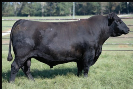
GIBBS KINGPIN 1140J