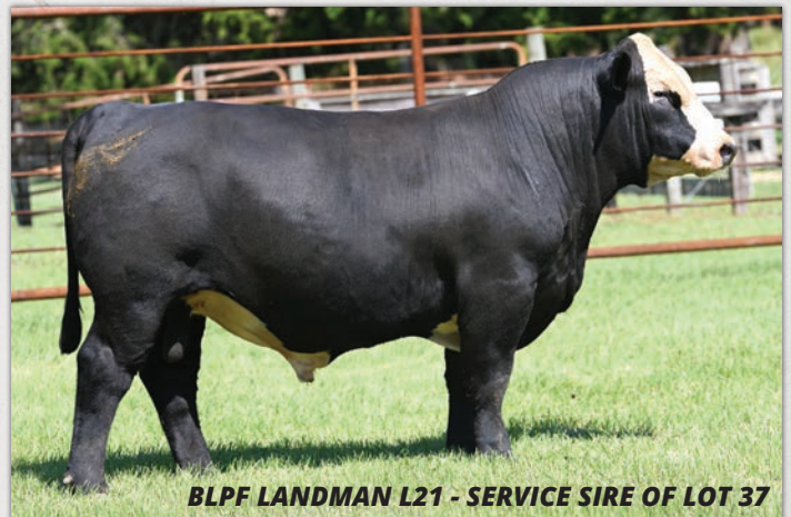
BLPF LANDMAN L21 - SERVICE SIRE OF LOT 37

Al'd to BLPF LANDMAN L21 (ASA# 4356774) on 12/27/25. Very productive young cow we offering in 686j, with outstanding blk blazed face Reserve heifer at side. Copper Reserve will be competitive if some jr wants a project but better yet this cow family has performed for a long time for us. We are keeping a Progressive daughter as replacement and this young cow will continue the family production, A Landman calf should be special too!