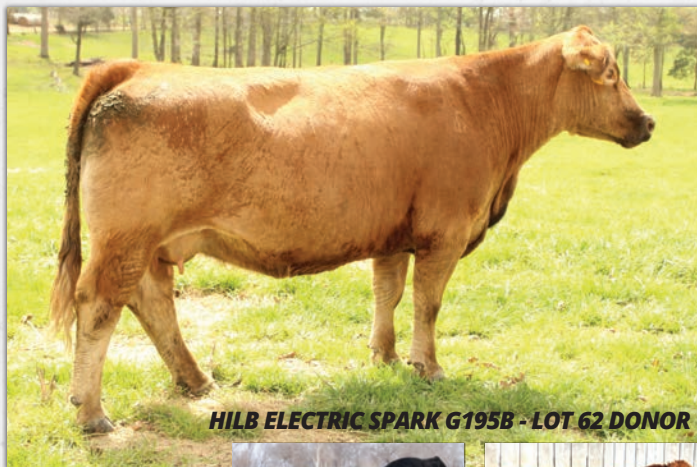
HILB ELECTRIC SPARK G195B - LOT 62 DONOR