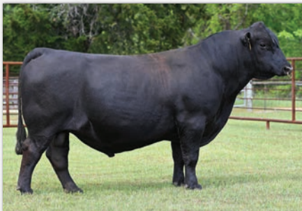
RVR TYSON 429K SERVICE SIRE OF LOT 2