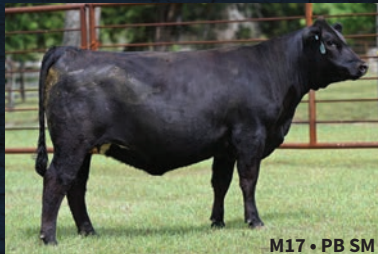
M17 • PB SM

ASA# 4532419 • Homo Black • Homo Polled RVR ROGUE 530H x BLPF LUCKY GIRL B13