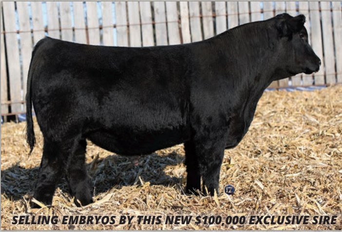
SELLING EMBRYOS BY THIS NEW $100,000 EXCLUSIVE SIRE