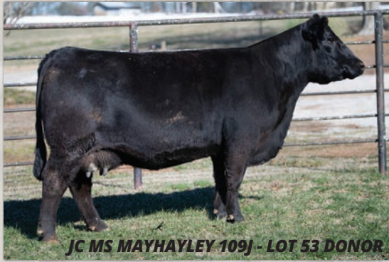
JC MS MAYHAYLEY 109J - LOT 53 DONOR