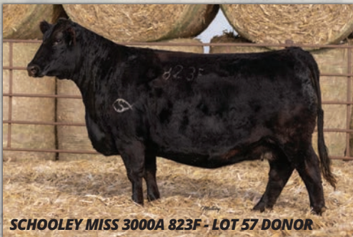
SCHOOLEY MISS 3000A 823F - LOT 57 DONOR