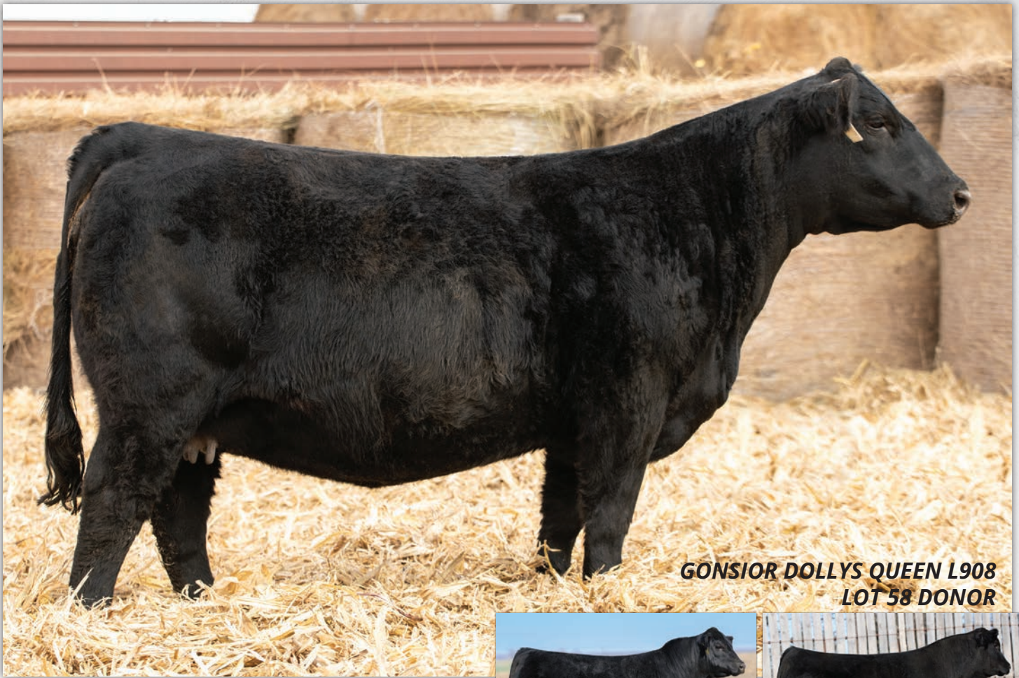
GONSIOR DOLLYS QUEEN L908 LOT 58 DONOR