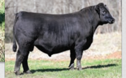
LOT 35A SIRE