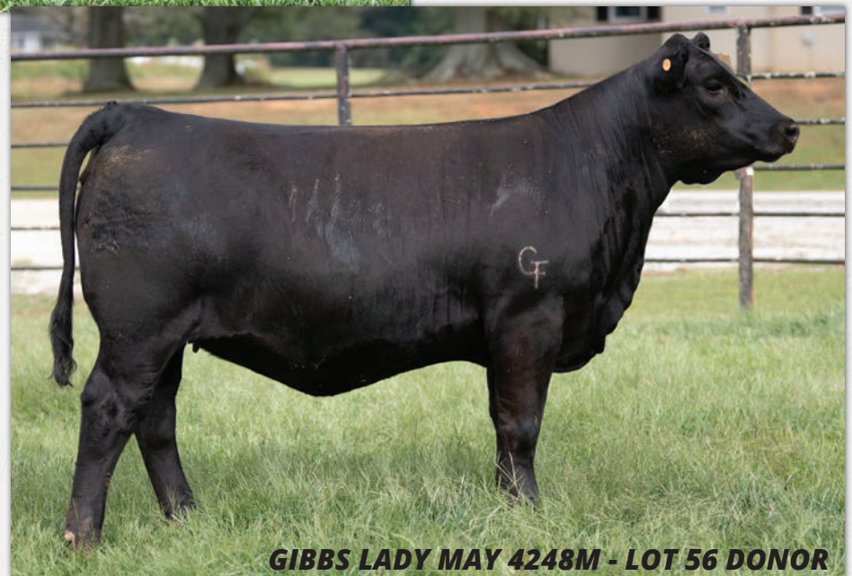
GIBBS LADY MAY 4248M - LOT 56 DONOR