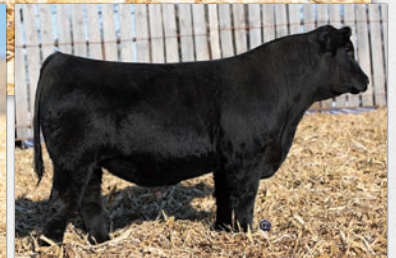
RFS NORTHERN EXPOSURE N14 SIRE OF LOT 58B EMBRYOS

Selling 3 IVF, Unsorted, Conventional Semen embryos. Guaranteeing 1 pregnancy if implanted by a certified embryologist. Stored at Preferred Genetics, Columbus NE. These two matings are guaranteed to grab attention. Both sires are extremely exclusive with no semen available on the open market. Monaco semen averaged nearly $3,100, while Northern Exposure has averaged $1,400 on their exclusive semen sales. Each mating is backed by our standout young donor L908, a female we're especially excited about. With full siblings to this donor averaging over $12,000, she sets herself apart as the biggest bodied stoutest of the group. Her brother Gonsior Keepin the Faith, is currently marketed through Cattle Visions further validating the strength of this pedigree. Don't miss your opportunity to be among the first to access these elite, hard to find genetics. Embryos of out Monaco averaged $1,700 on River Creeks Farms exclusive Monaco embryo sale. This is the first set of Northern Exposure embryos to be offered at public auction.