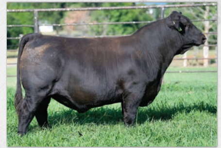
GIBBS HIGHWAYMAN 3130L SIRE OF LOT 55 EMBRYOS