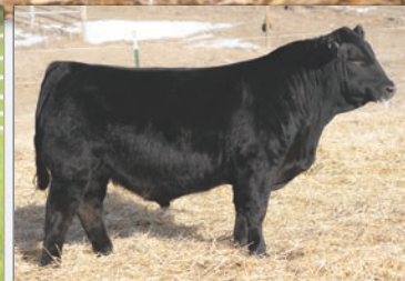
CLRS MONTANA 2102M SIRE OF LOT 57C EMBRYOS