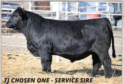
TJ CHOSEN ONE - SERVICE SIRE