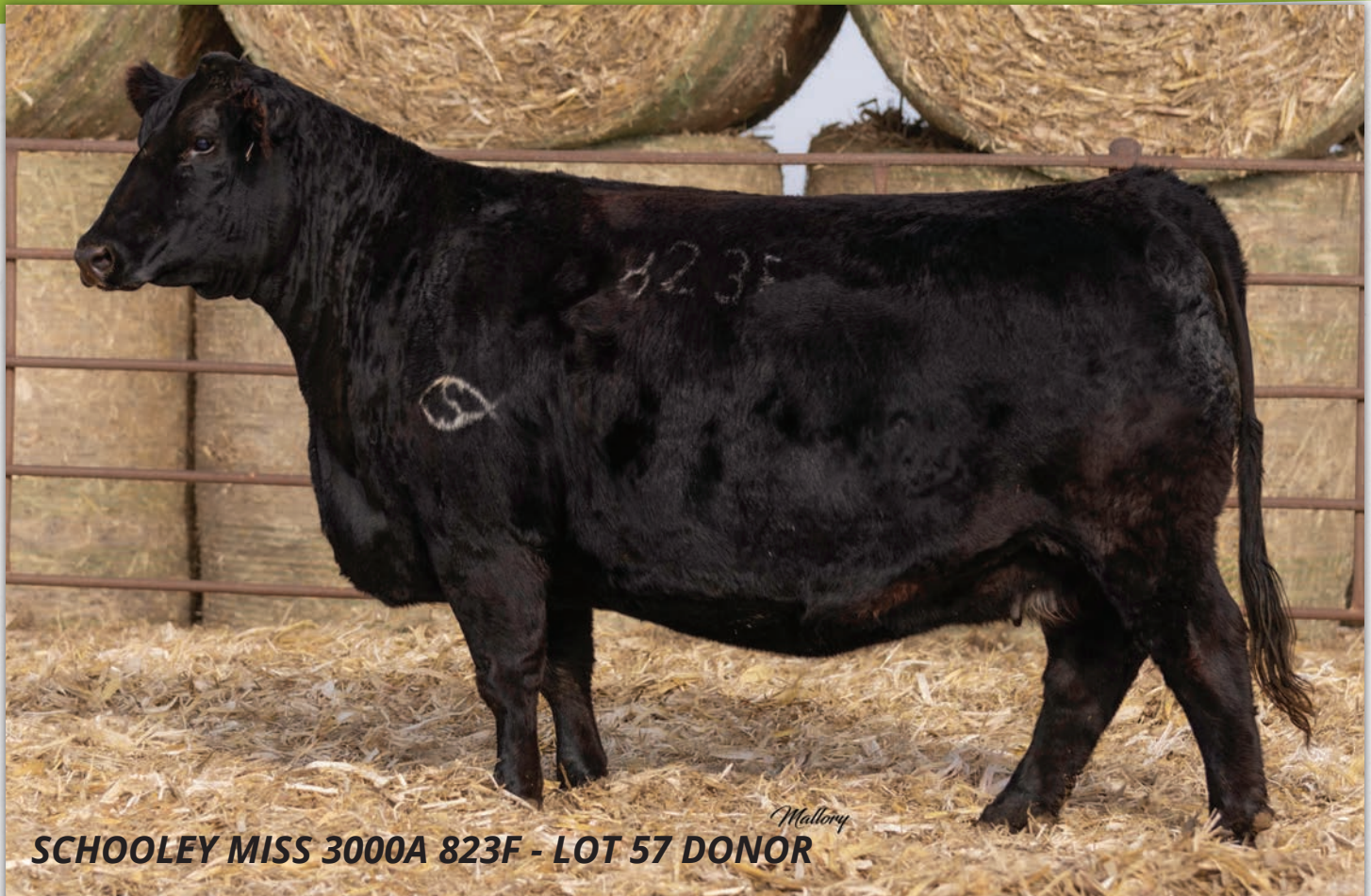
SCHOOLEY MISS 3000A 823F - LOT 57 DONOR