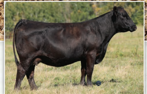
BRIDLE BIT Prelude L372 - $200,000 Dam

RFS Northern Exposure N14 is the best purebred Simmental to sell this spring. With the base changes at IGS and the American Simmental Association it's harder than ever to find purebred bulls with this high of calving ease top 10%, light birthweight top 5% and above average growth. He does this while posting top 5% MCE, top 4% STAY, top 25% DOC, top 1% Marb & API and top 2% TI. His sire RFS CREDENTIALS L49 is one of the best GIBBS 9114G ESSENTIAL sons and is out of KBHR MEDORA G132 the dam to KBHR HOMELANDER J071. We haven't even mentioned the best part of his pedigree! His dam BRIDLE BIT PRELUDE L372 sold as an open heifer for $200,000. We were contending bidders who were in at $195,000. Talk about