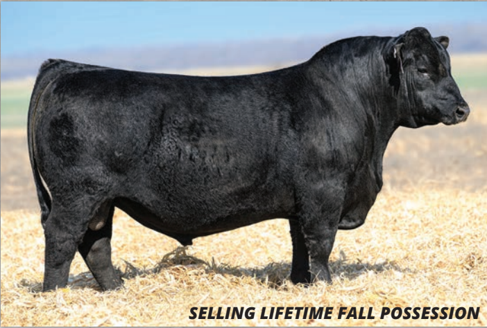
SELLING LIFETIME FALL POSSESSION