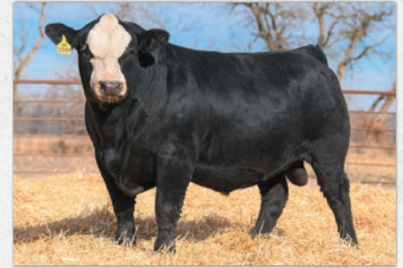
RVR ROGUE 530H SIRE OF LOT 51