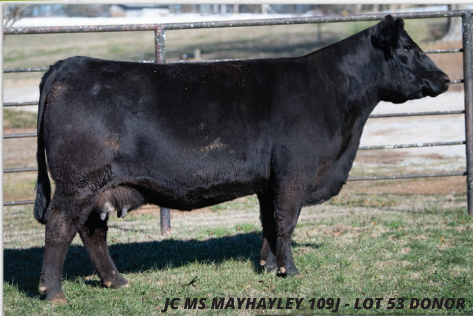
JC MS MAYHAYLEY 109J - LOT 53 DONOR