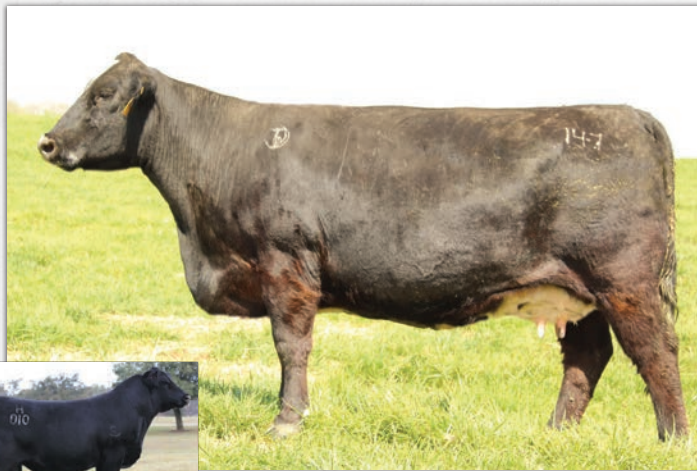
MISS CCF DELTA DAWN D147 - LOT 61 DONOR