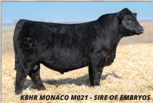
KBHR MONACO M021 - SIRE OF EMBRYOS