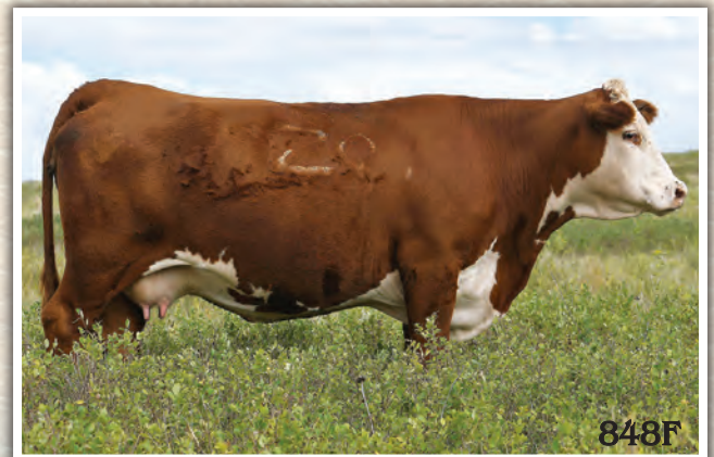
BCC Dominette 848F. Dam of 393.