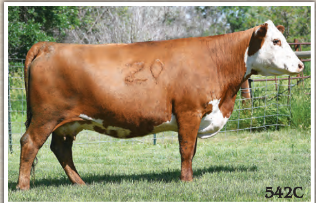
BCC L1 Tama 542C ET.

Horned. Dark red, thick from end to end. Backed by great cow families. Milk is strong here. Top 3% MM, MG, 11% BMI, BII, 22% WW. Eye Pigment: 100% both eyes.