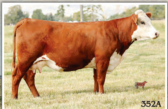
CL 1 Dominette 352A 1ET. Grandam of 345.

Polled heifer bull. Long with plenty of depth. Top 3% BW, 15% BII, BMI. Eye pigment: 60% left, 100% right.