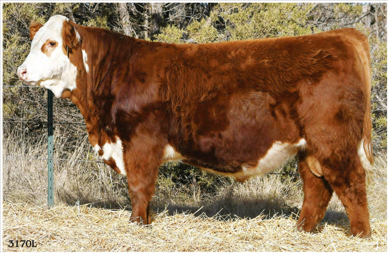
BCC Scarlet 562C. Dam of 3173.