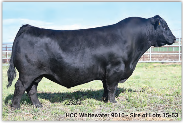
HCC Whitewater 9010 - Sire of Lots 15-53

$Profit: $22,267; Top 6% • Has a yearling ratio of 109 • Has a Urib ratio of 107 • Dam has an average weaning ratio of 103, yearling ratio of 106 • Dam has an average Uimf ratio of 105, Urib ratio of 107